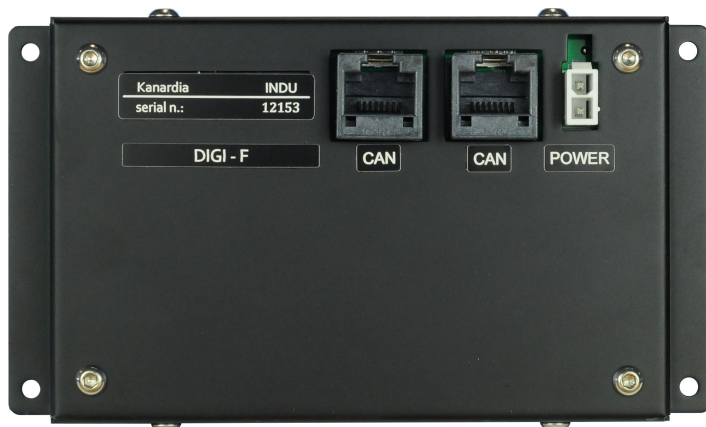
Figure 2: Back view of the Digi with connections.

cable is needed due to different connector type on the Daqu side. (The cable comes with the Daqu unit.)