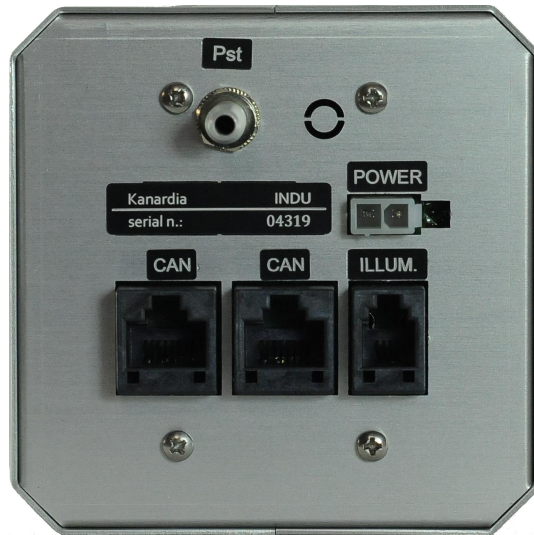
Figure 3: Back view of the 80 mm instrument with connections.

When connected to the bus, vaiometer will transmit vertical speed to other units connected on the bus.